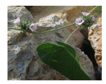
Fig. 1: Ipomoea. eriocarpa R. Br. in Natural Habitat

International Journal of Plant Sciences and Phytomedicines (IJPSP) Volume 1; Issue 1; 2021; Page No. 51-61